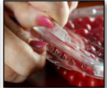
Simple One-Step Opening Tamper-Evident Raised Hinge Consumer Alert Message Easy-Opening Hinge Tabs