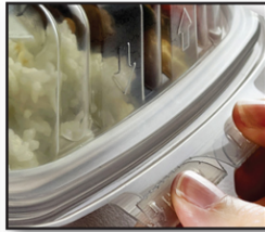
Intuitive Opening Tabs