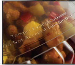
Consumer Alert Message